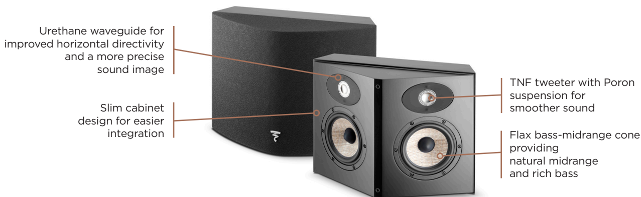
Aria SR900 Black Satin

Aria SR900 is a 2-way bipolar surround loudspeaker. Composed of two 5" (13cm) woofers with Flax sandwich cones, it provides very high-definition and natural sound. For the treble register, there are two aluminium/magnesium inverted dome tweeters with Poron suspension and a waveguide for a better control of directivity. Thanks to the Polyfix wall-mounting system provided, the compact SR900 loudspeaker is easy to integrate into your interior.